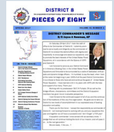
Pieces of Eight - on Home page