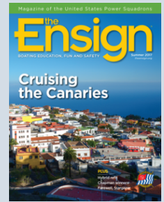
Ensign Home page